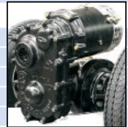
GT Automotive Drive